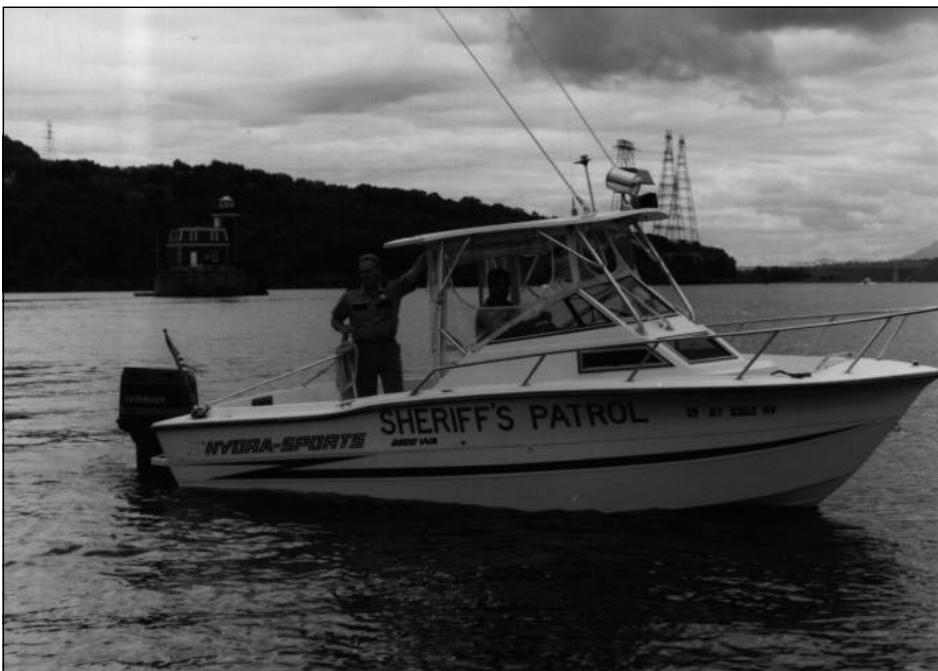
Rural patrol can include the Nation’s inland waterways.

Even less is known about rural-urban differences in child abuse, but two studies by the National Center on Child Abuse and Neglect 24 suggest the issue is worth further study. The first study was conducted in 1980 and the second in 1986. The studies differed in one important respect. In the 1980 version, abuse was defined as “demonstrated harm as a result of maltreatment.” 25 The 1986 study included a definition of abuse that mirrored the 1980 definition, but also in-