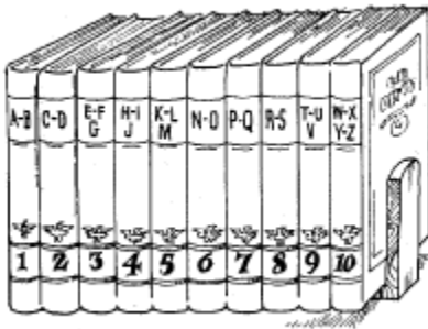
Figure 4. Finding Information in Parts of a Book, Primary Level

Use this table of contents from a book called Mountains to answer questions 14–20. For questions 14–16, write the chapter number that best answers the question.