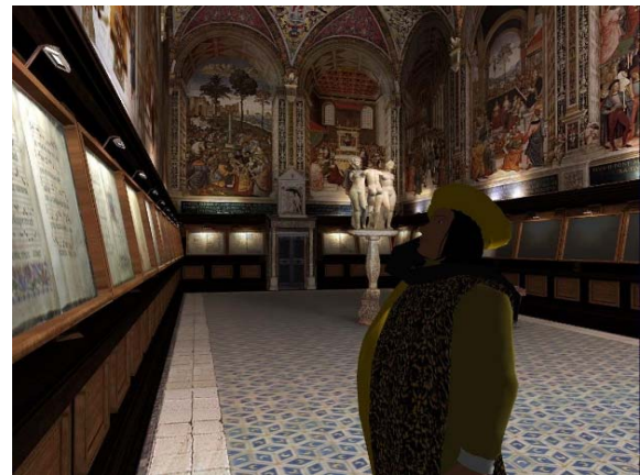
Fig 2: Library of the Cathedral of Siena with the virtual guide

The operation of the system was very intuitively. On a touch-screen a graphical user interface was shown, which looked like an ancient book. By using the displayed controls in this book, the user is able to browse through the book and depending on the position of the viewer in the cathedral, the presented information was adapted accordingly. A map of the cathedral allows him to navigate around.