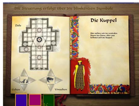
Fig 3: Interface of the exhibit. Touch screen with the layout of an ancient book

Furthermore a virtual tour guide named Luigi was integrated into the system. Luigi is a virtual character with a realistic appearance, who is able to provide the visitor with assistance and information via speech output (Behr et al. , 2001) [6] .