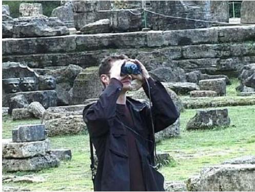
Fig 6: Test of the Archeo Guide System (Vlahakis et al. 2002) [2]

Fourier analysis of the image (Stricker 2002) [10] and allows optical tracking without markers being attached to the surrounding even in outdoor condition. Several trials proved the validity of the approach and strongly promoted the introduction of new media in this area.