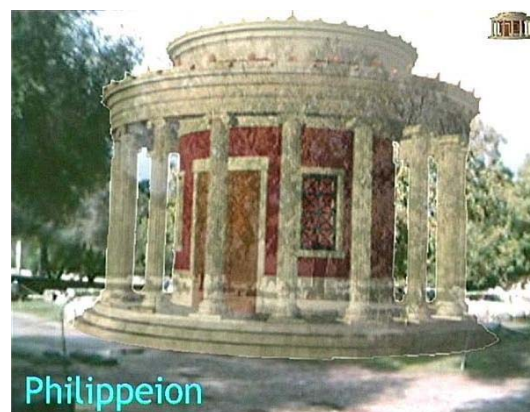
Fig 5: Augmentation of the virtual reconstruction of the Hera Temple (Olympia, Greece)

The goal of the European project Archeology Guide was to provide new ways of information access at cultural heritage sites (Vlahakis et al. 2002) [2]. Together with partners from Greece, Italy, and Portugal, we developed a mobile augmented reality system, which allowed visitors to see computer-generated reconstructions on the ruins of an archaeological site, and get information in context with his/her position.