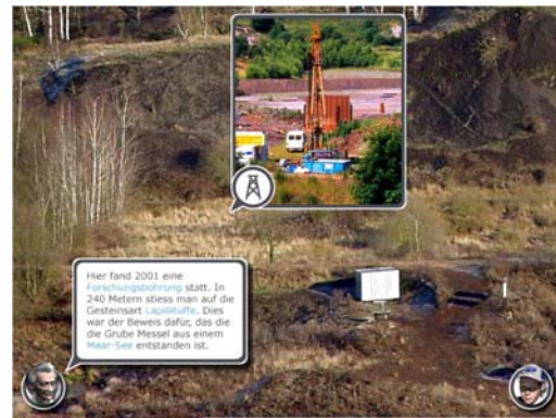
Fig 8: Example of information augmentation

Tracking and camera configuration Animated and interactive 3D scenes Video and 2D animations Light simulation Occlusion objects We noticed that the quick and simple way to generate content was a feature, which strongly contributed to the success of the AR-Telescope.