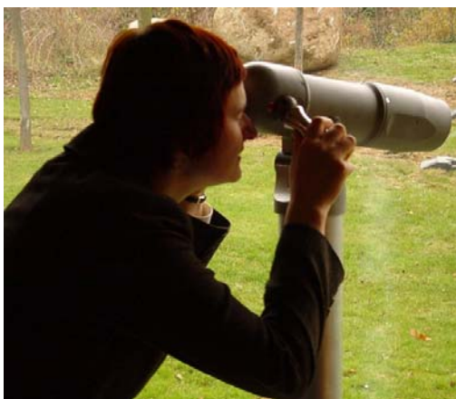
Fig 7: The augmented reality telescope

The augmented reality telescope "xc-01" represents a very pragmatic special solution and a good approach to successfully turn ar-technology into real applications (Becker 2004) [4]. The base idea consists in embedding an augmented reality system into a classic coin-operated telescope. This approach provides two major advantages: on the one hand, the usage of a telescope is familiar to everyone, what ensures a large acceptance of the new device, and on the other hand, the device is fixed at a given place, so that its technical realization is strongly simplified. The system comprises a high-resolution camera, a high-contrast LCD-display, a precise hardware tracking system, an air condition for outdoor use, and finally a small pc-unit. All these components are integrated into a strong vandalism proven steel case. The user sees in real-time video of the real scene augmented with virtual information. The tracking of the telescope orientation is achieved with help of two sensors placed at its rotation axis.