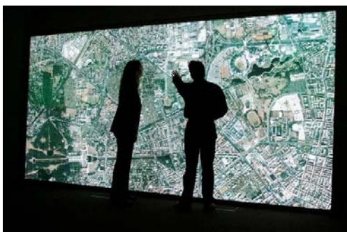
Fig 4: The Heye Wall, a tiled display with 48 beamers and PCs (Heye Wall, 2004) [8]

They are arranged together in a steal construction one meter behind the screen. The modular system can be scaled arbitrarily. One major development, which had to be carried out, was the color calibration and color matching of the projectors.