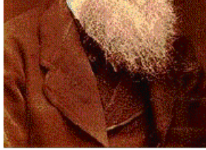
Ch. Darwin Nov. 7 th 1874.

Links to our Past News of the Present Insight for the Future