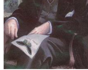
Alfred R. Wallace

Links to our Past News of the Present Insight for the Future