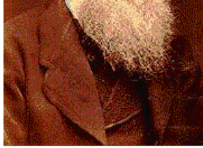
Ch. Darwin Painted 7 th 1874.

Links to our Past News of the Present Insight for the Future